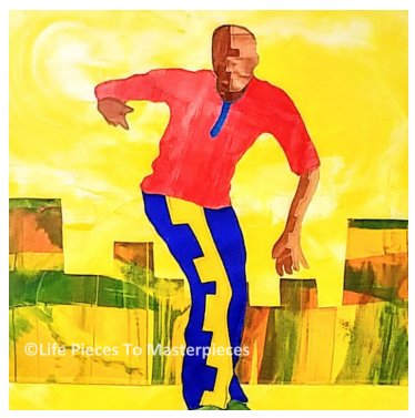
Third Time's the Charm 2019 26 x 32 inches Acrylic-painted textile collage

No matter what happens in life, we will always be brothers. I got your back; you got my back. Brothers for life.