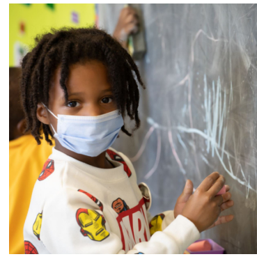
An LPTM Apprentice expresses himself through chalk art.

An Apprentice kept falling down and down until a young lady came over to help him.