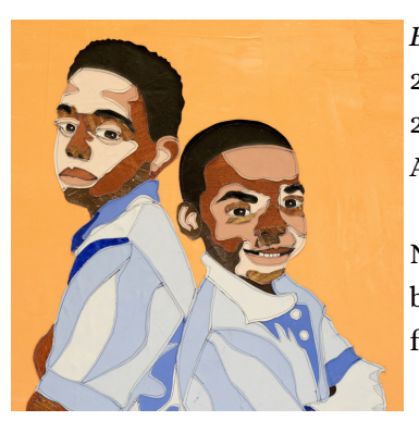
Brotherhood 2019 26 x 32 inches Acrylic-painted textile collage

No matter what happens in life, we will always be brothers. I got your back; you got my back. Brothers for life.