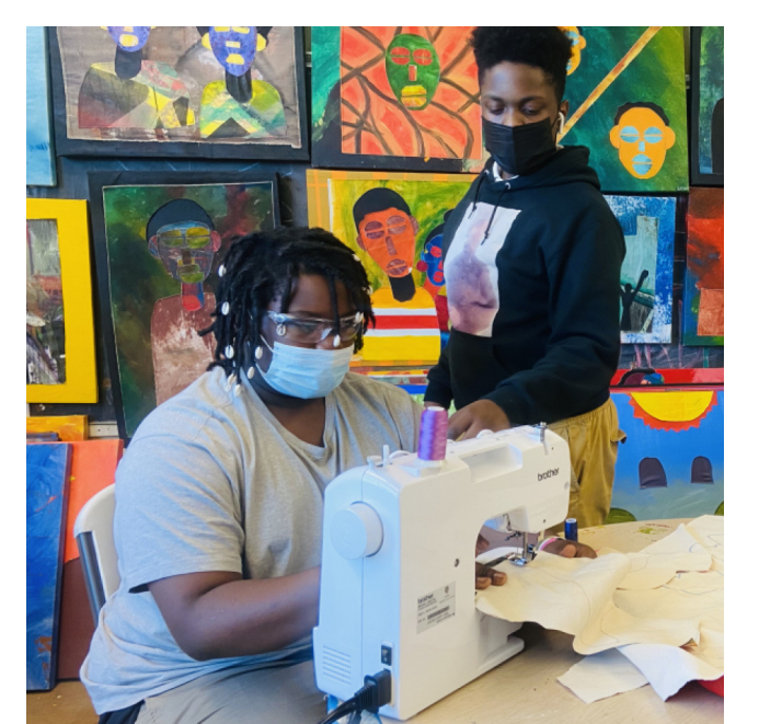
Two LPTM Apprentices work on their sewing skills to create art.