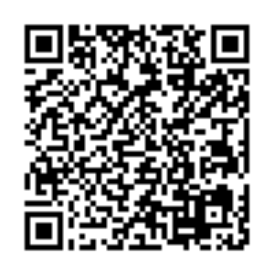
Use this QK code to register today

"Seekers and Sneakers" is an interactive Vacation Bible School where children use their investigative skills to discover Jesus! Through worship, drama, Bible stories, music, art, science, and games, children are invited to follow the example and teachings of Jesus in every place and every part of life. This is going to be a great adventure!