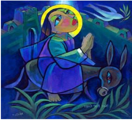
“Holy Entrance” by He Qi

NATIONAL UNITED METHODIST CHURCH Metropolitan Memorial Campus 3401 Nebraska Ave NW Wesley Campus 5312 Connecticut Ave NW Washington, DC