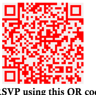
RSVP using this OR code